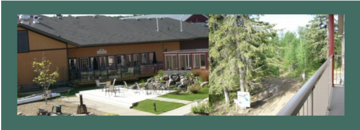
The Balcony View At Heron Place